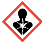
GHS08 Health Hazard