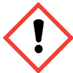
GHS07 Harmful Irritating