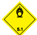
Class 5.1 HAZARD Oxidizing Substances

ADR , Annex A General provisions and provisions concerning dangerous substances and articles; Classification; Class Specific Provisions