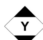
Limit Quantities by Air